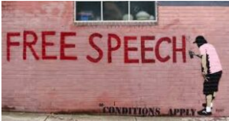
Free Speech "Conditions Apply"

https://goldenageofgaia.com/2025/02/26/while-we-were-sleeping/