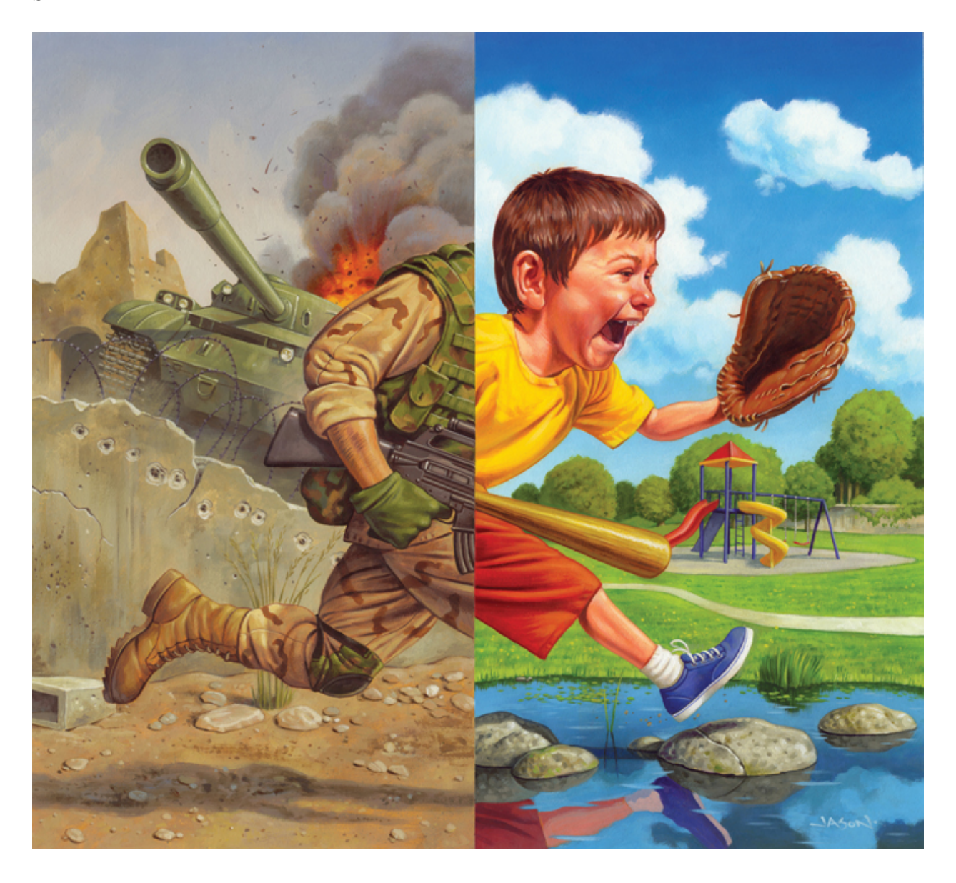
We may ... OK, OK, I may ... be missing a huge dimension of the Emergency Broadcasting System and we won't be able to discuss it once the ten days of darkness kick off.

So I'd better say it now, before the EBS chimes in ... and our world changes forever.