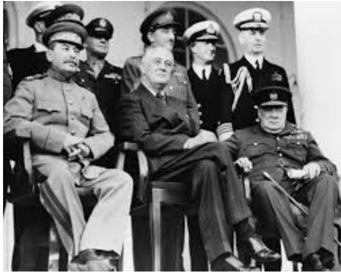
The Allies at Yalta

At the Yalta conference in World War II, when President Franklin Roosevelt had only a short time to live, Russian Premier Josef Stalin joked that, at the end of the war, 50,000 Germans must be shot.