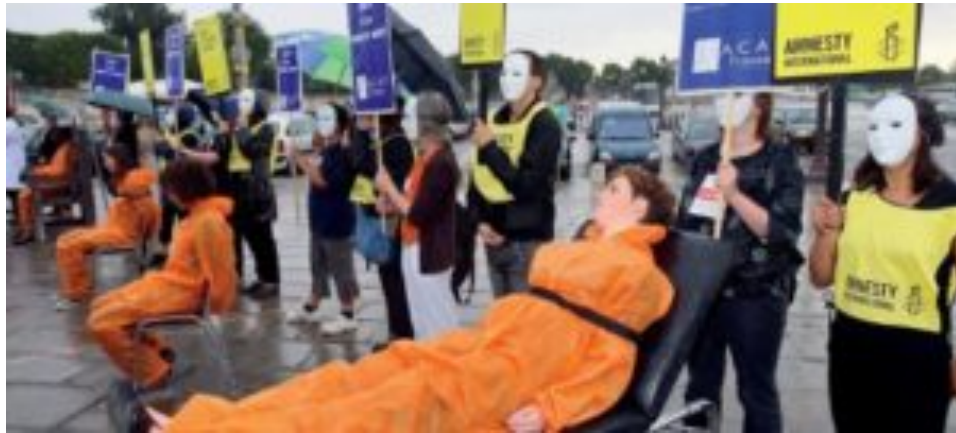
Stop the Executions protest

https://goldenageofgaia.com/2024/09/28/let-this-generation-stop-the-killing/