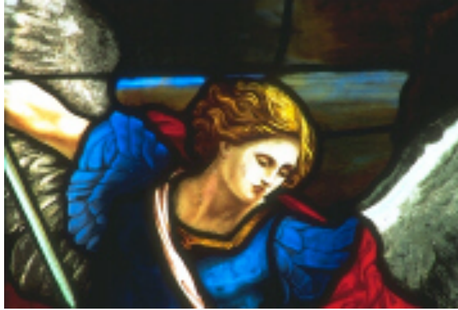
Banner of Michaelangelo & Partners

https://goldenageofgaia.com/2024/06/12/a-fresh-and-vibrant-palette/