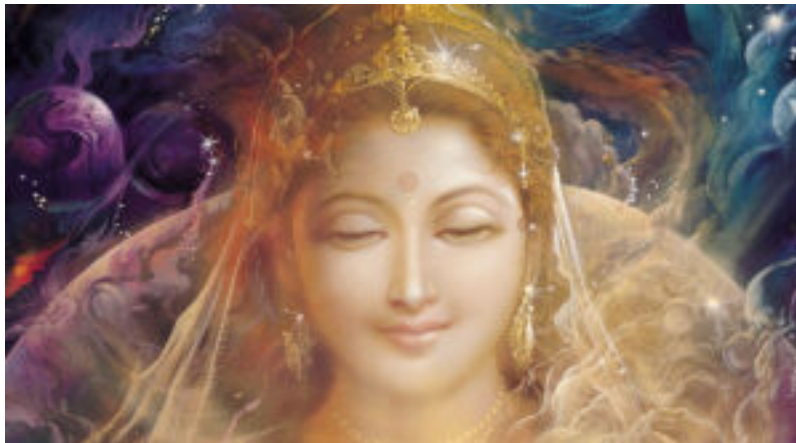
The Divine Mother

https://goldenageofgaia.com/2024/06/26/what-is-the-source-of-our-authority/