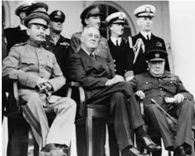
The Allies at Yalta

At the Yalta conference in World War II, when President Franklin Roosevelt had only a short time to live, Russian Premier Josef Stalin joked that, at the end of the war, 50,000 Germans must be shot.