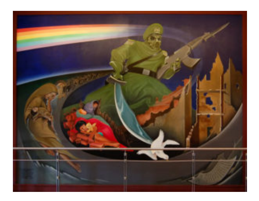
Soldier kills the dove of peace at Denver Airport

It is logical to think: Does it matter which [Illuminati] faction is dominant [in the Mideast] if both have the same intention? It does only in the very short term as to what may ensue in the Mideast.