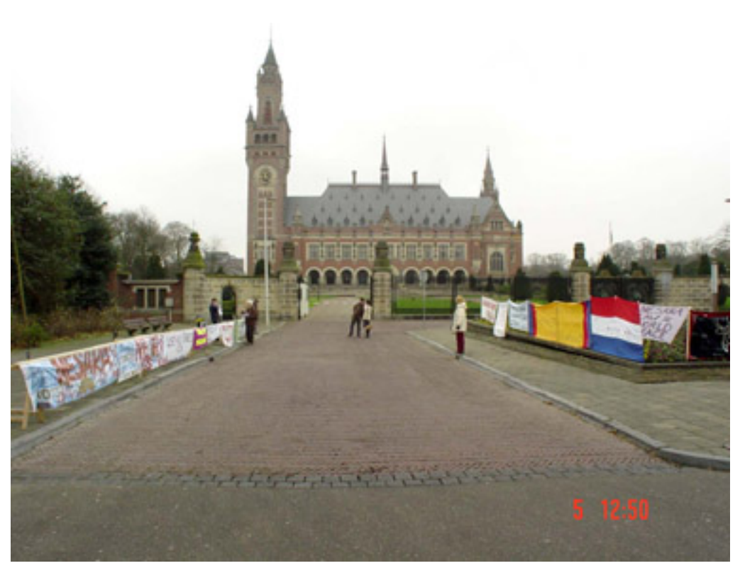
The road to the Peace Palace