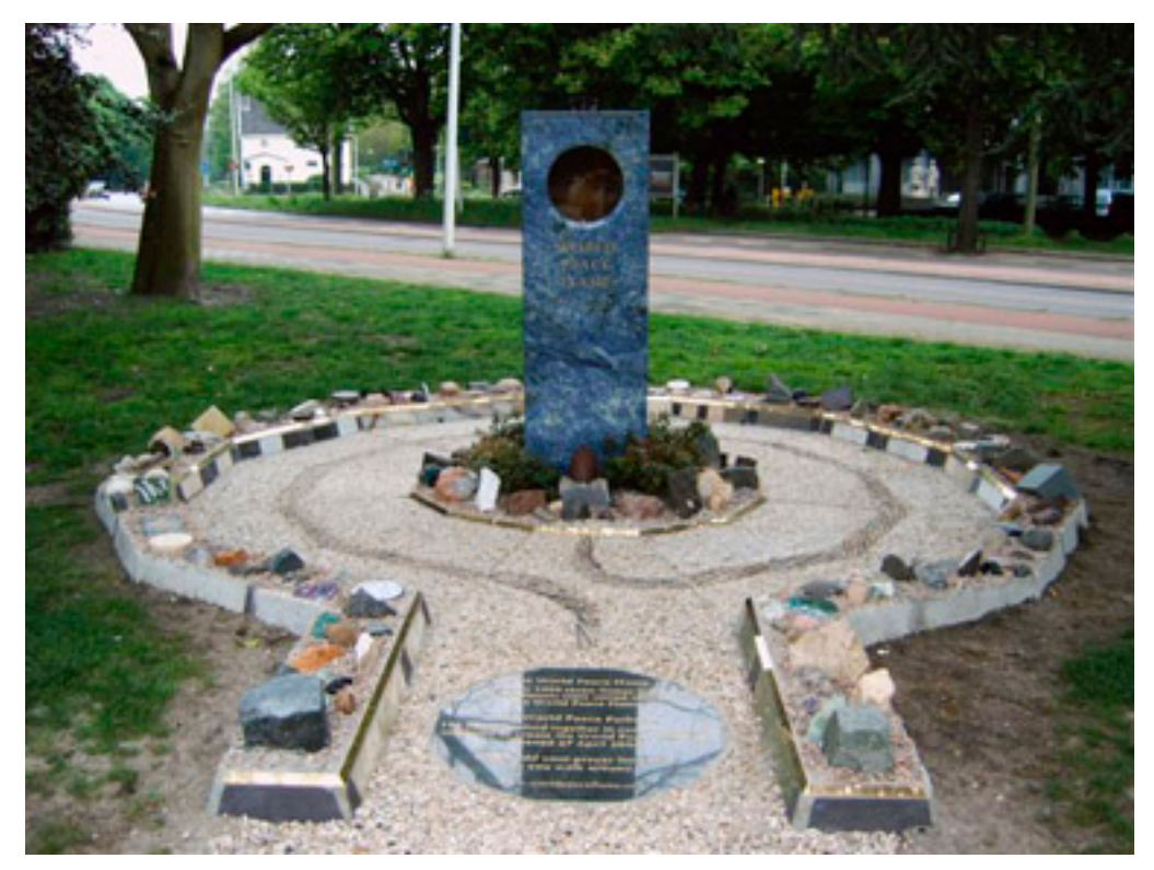
The World Peace Pathway.