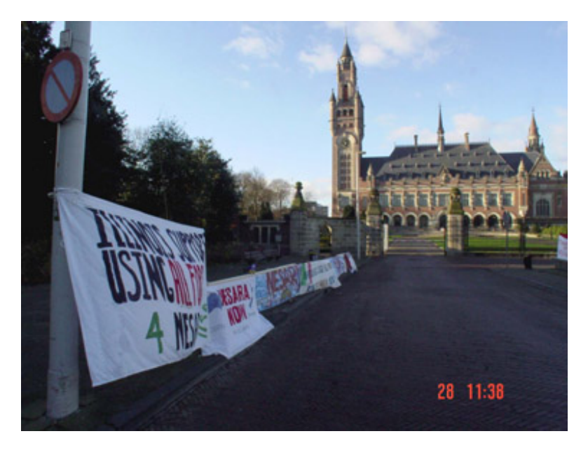
We had more banners than people present!