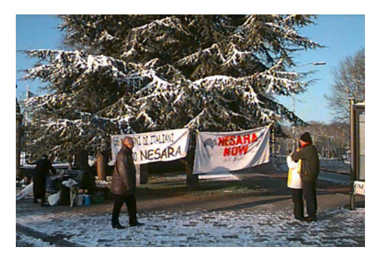
The beginning of a 'white' new year

NESARA's dedicated demonstrators were not deterred by the weather, whether it was rain, snow, winds, cold, or those blessed days of warm sunshine. During several of the demonstrations, a rainbow appeared over the Peace Palace. Once weekly, for 40+ weeks, they demonstrated four hours — 10 AM to 2PM. In addition to handing out flyers in the various languages, they talked to tourists, explaining NESARA and answering their questions about it.