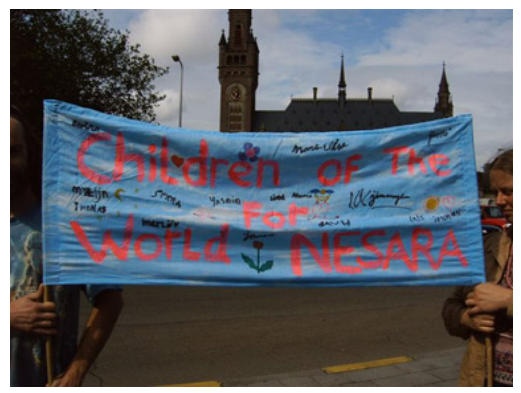
"Children of the World for NESARA".