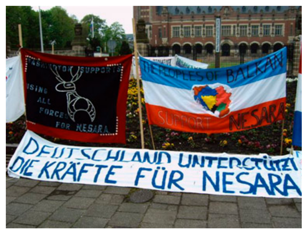
Washington, the Balkan and Deutschland for NESARA NOW!