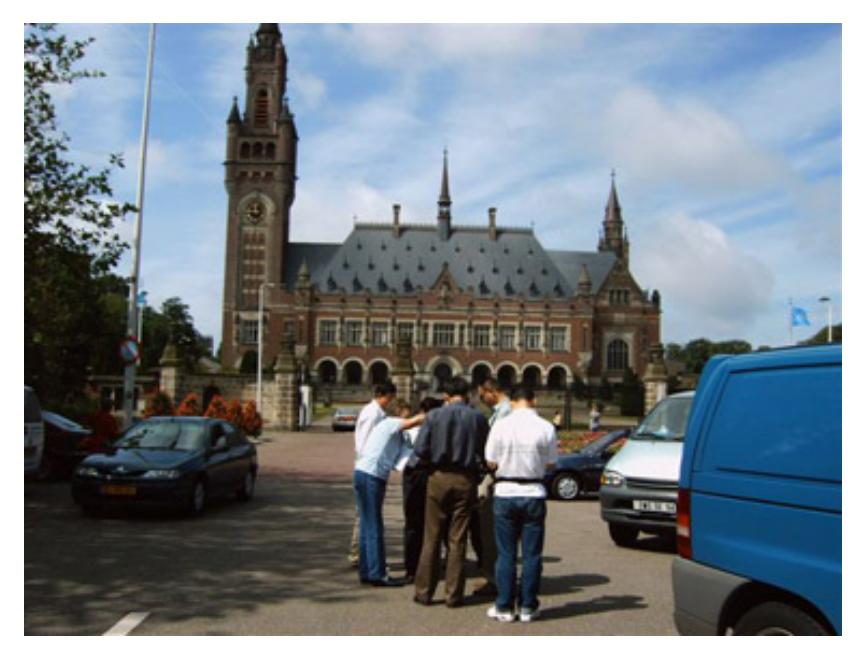
Miep handing out flyers to tourists.