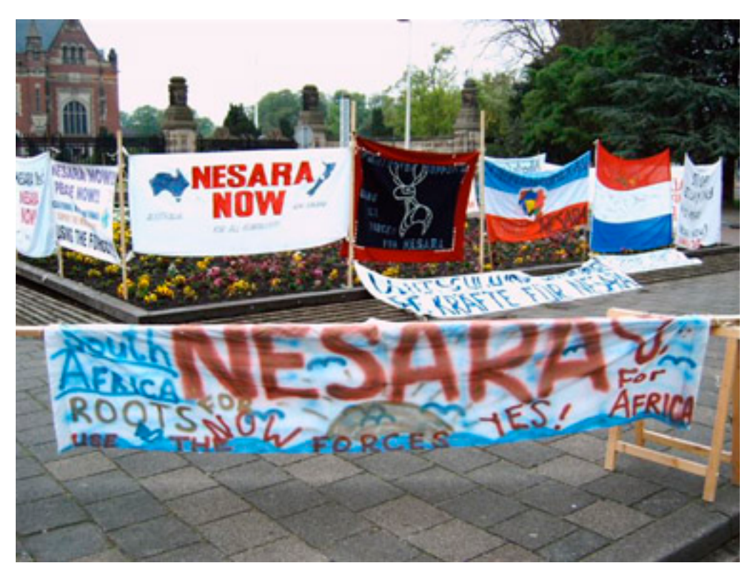
South Africa, Germany, Australia, New Zealand, Washington, the Balkan countries and the Netherlands for NESARA NOW!