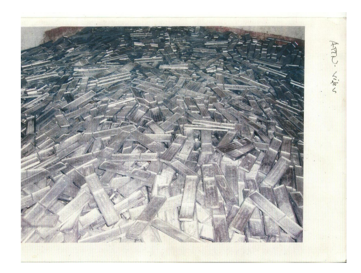
Part of treasure trove of platinum recovered from American warships sunk off the Philippines

https://goldenageofgaia.com/2013/07/06/nesara-and-the-revaluation-part-12/