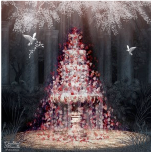
Fountain of Love by Cherished Memories

The other night I awoke at around 2:30 a.m. absolutely certain that I was a fountain of love. As are we all.