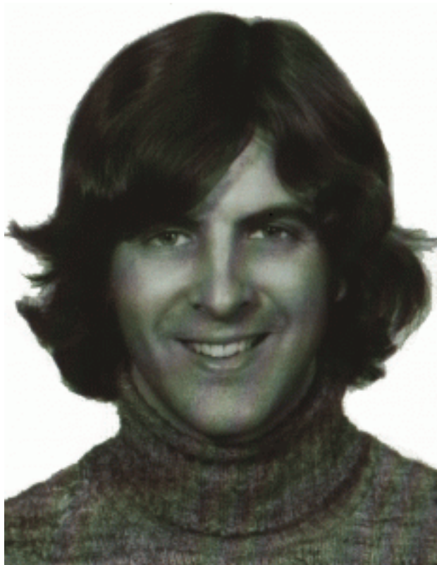
2023: Portrait of the artist after med beds. Just so you'll recognize me