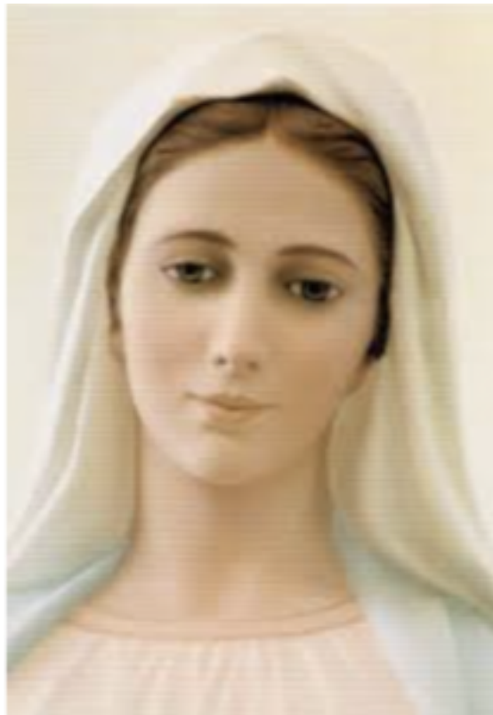
The Divine Mother incarnated as Mary the Mother of Jesus