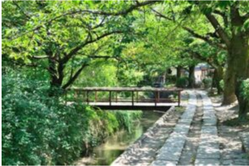
Philosopher's Walk, Kyoto

https://goldenageofgaia.com/2023/09/02/arriving-in-life/