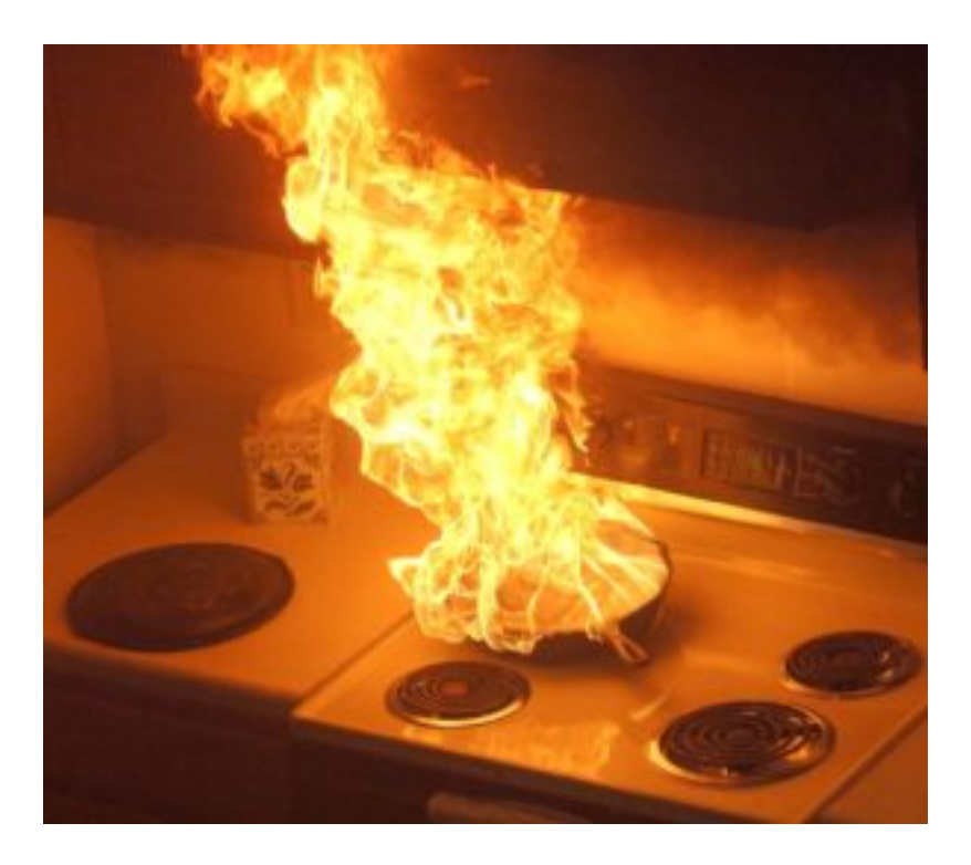
That's pretty close

https://goldenageofgaia.com/2021/05/15/getting-divine-protection/