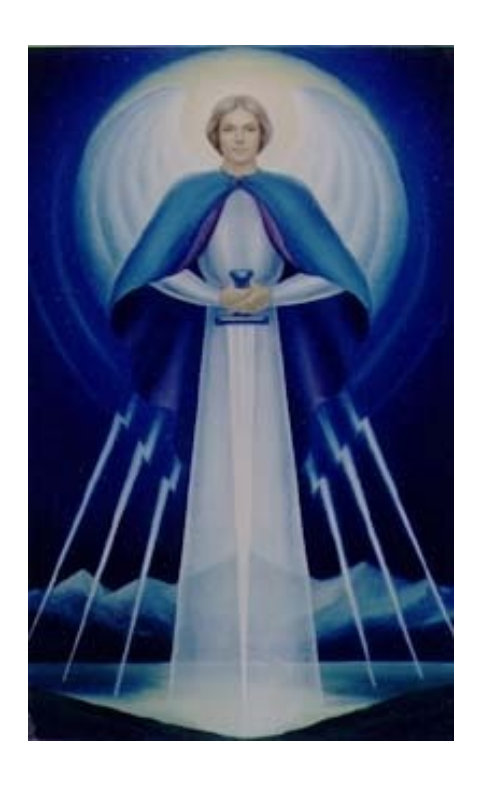
A "Mighty One"

https://goldenageofgaia.com/2018/06/28/the-company-of-heaven-has-our-back/