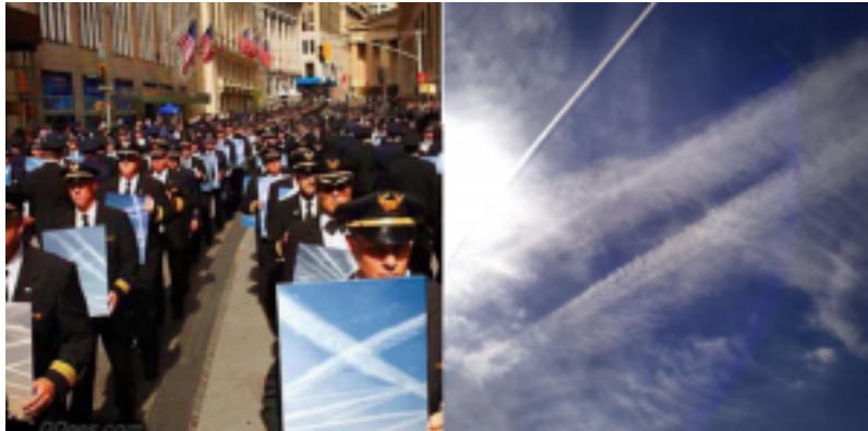
Pilots marching to protest chemtrails

https://goldenageofgaia.com/2023/02/26/whats-actually-happening-with-chemtrails-part-2-8/