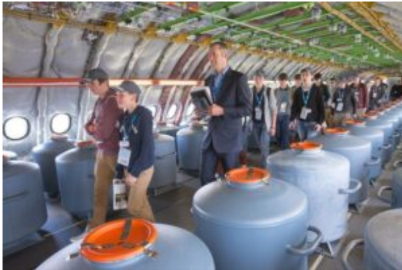
A tour of a chemtrail plane!

https://goldenageofgaia.com/2023/03/02/whats-actually-happening-with-chemtrails-part-6/