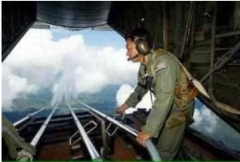
Spraying from the back of what looks like a C-130