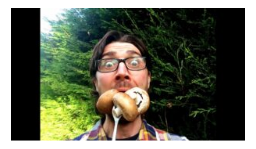
"Are we all going to be eaten by a giant mushroom?"