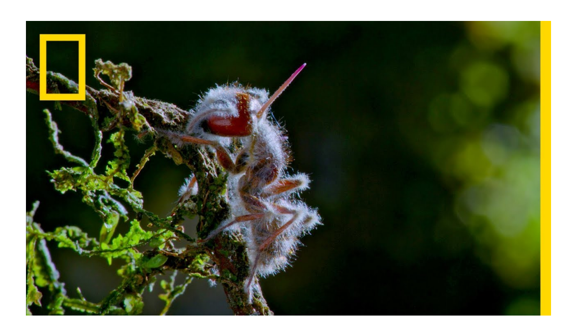
Here's one more video, from National Geographic this time: Zombie Parasite takes Over Insects.