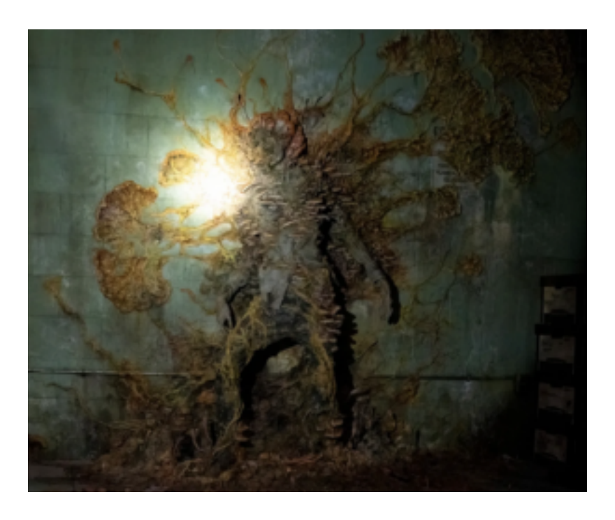
In 2013, HBO had a series on a fungal outbreak: The Last of Us, based on a video game by the same name. Thanks to Sitara.