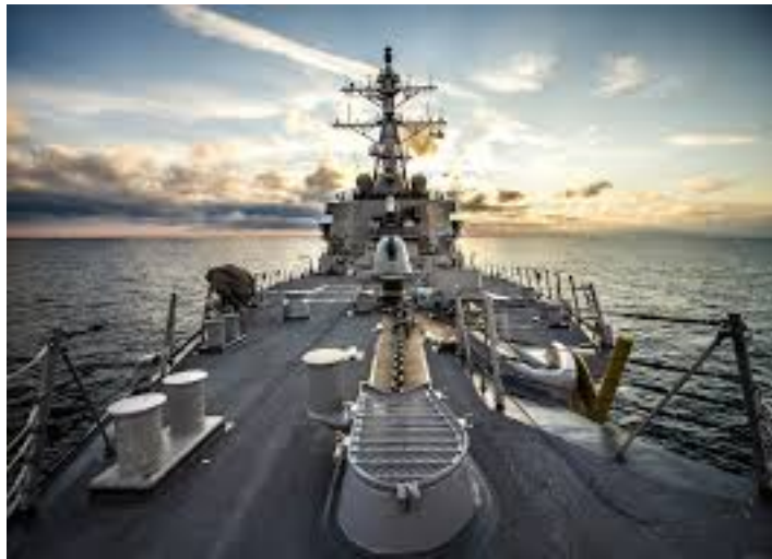
The U.S.S. Donald Cook

“The Days of Military Conquest are Over,” December 6, 2014, at https://goldenageofgaia.com/2014/12/06/the-days-of-military-conquest-are-over/