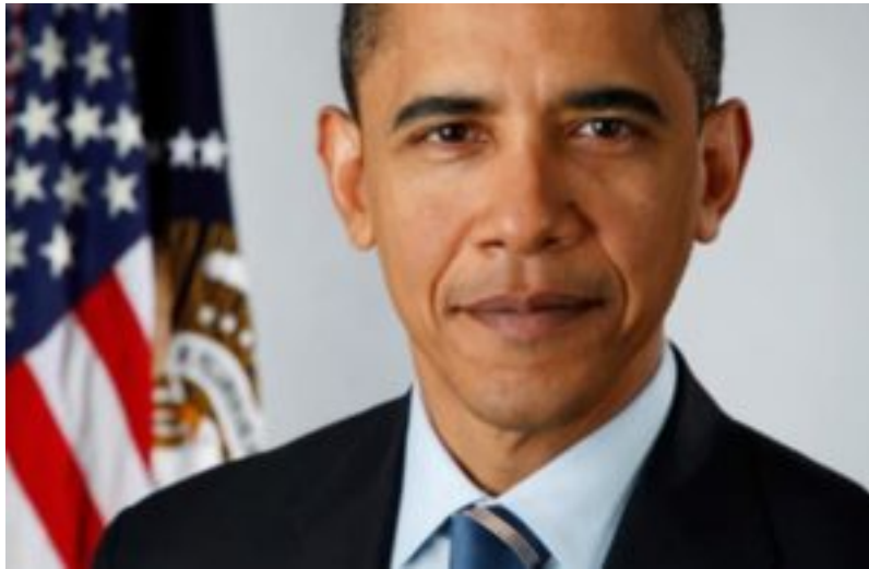
President Obama (1)

"Inclusivity Rather than Exclusivity," March 13, 2019, at https://goldenageofgaia.com/2019/03/13/inclusivity-rather-than-exclusivity/