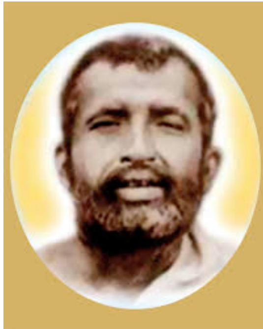
Sri Ramakrishna in samadhi