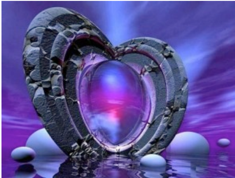
Imaginative depiction of a portal.