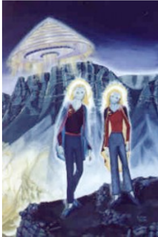
A depiction of Arcturians From Connecting with the Arcturians, p. 27.