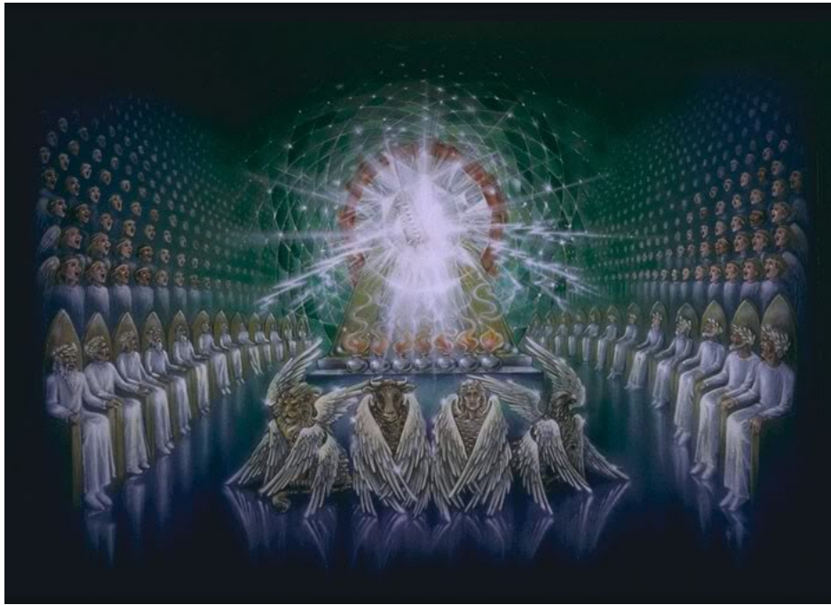
Representation of the Elohim

https://goldenageofgaia.com/2014/09/01/who-are-the-elohim-part-23/