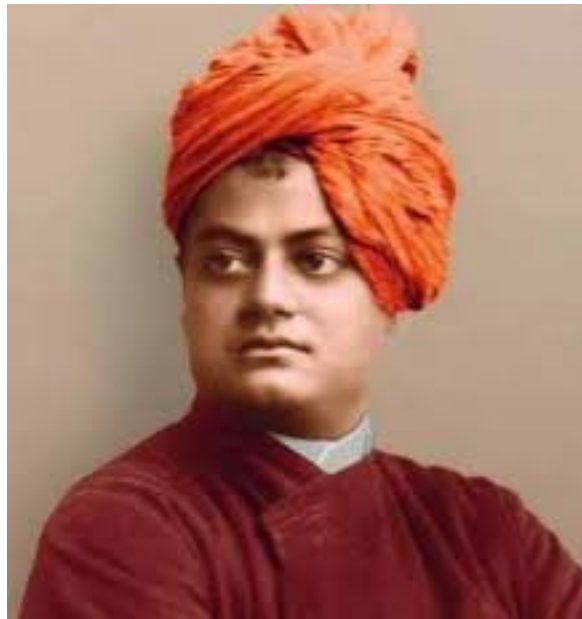
Swami Vivekananda - Apparently an incarnated Elohim

https://goldenageofgaia.com/2014/08/31/who-are-the-elohim-part-13/