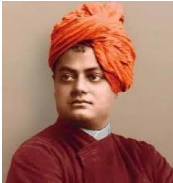
Swami Vivekananda - Apparently an incarnated Elohim

There are wondrous beings helping us with Ascension. I had an enjoyable discussion with an attendee at the Vancouver Golden Gaia Meet-up on the Elohim, which rekindled my interest in these elevated beings.