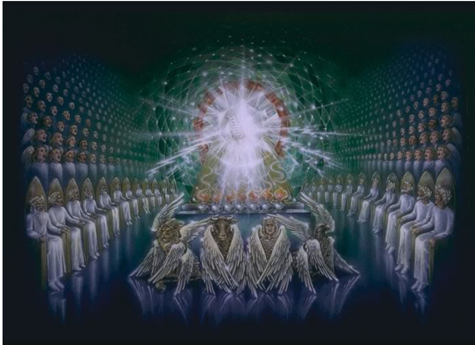
Representation of the Elohim

The word “Elohim” in the Old Testament is often interpreted as God. But the Council of Nine tells us: “We wish you to know we are not God.” (1)