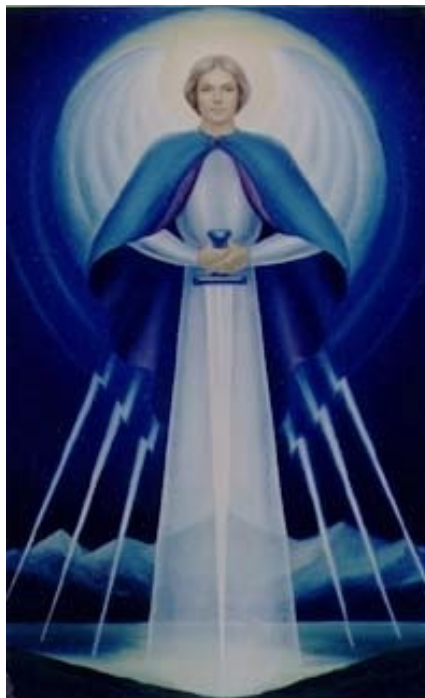
A "Mighty One"

https://goldenageofgaia.com/2018/06/28/the-company-of-heaven-has-our-back/