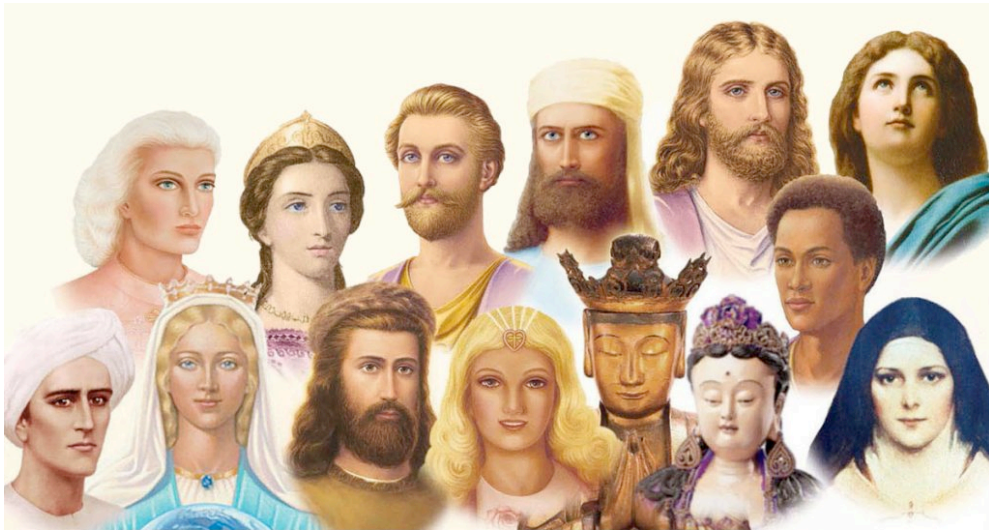
Part of our design team