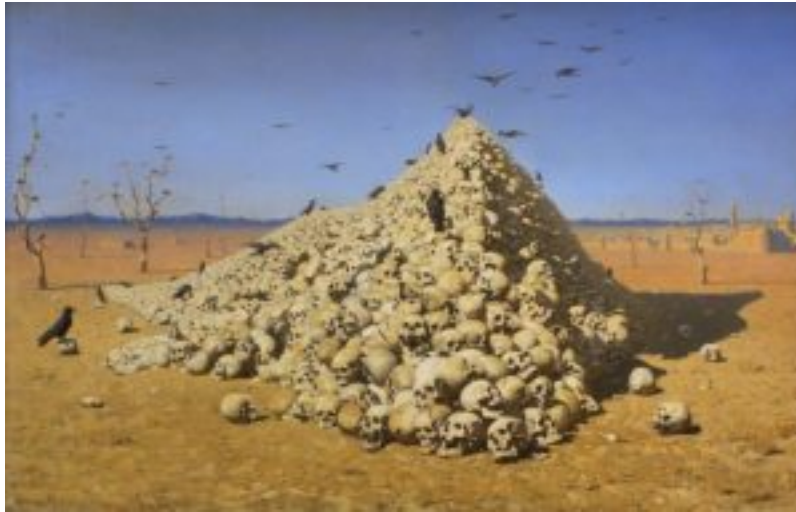
Depiction of mountain of skulls left by Tamurlaine. (1)

My email is running heavily in favor of executing the cabal. I'm dismayed.