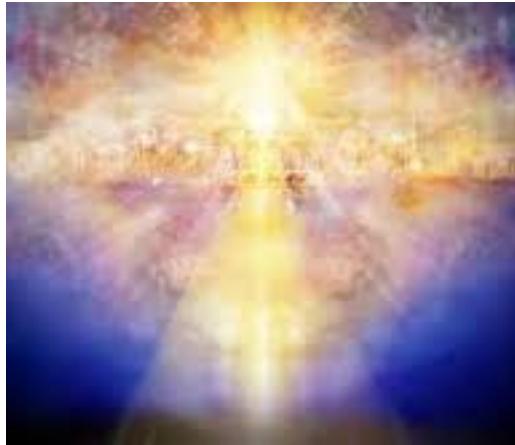
Angels mediate enlightenment

of as Ascension. It brings with it Moksha or liberation from the round of birth and death.