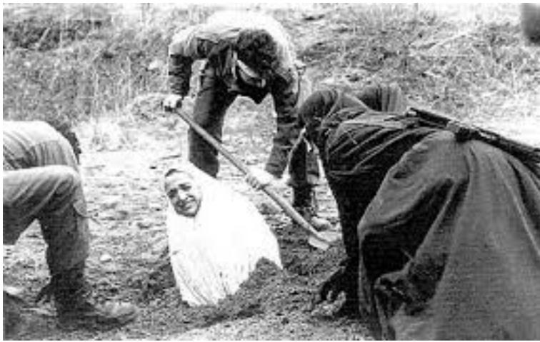
A repressive regime

Over ten days while we're watching TV perhaps? Seeing how fast Iran is crumbling, it very well could be.