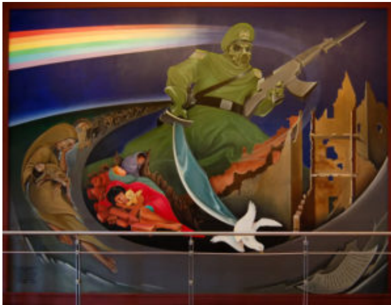
Soldier kills the dove of peace at Denver Airport

It is logical to think: Does it matter which [Illuminati] faction is dominant [in the Mideast] if both have the same intention? It does only in the very short term as to what may ensue in the Mideast.