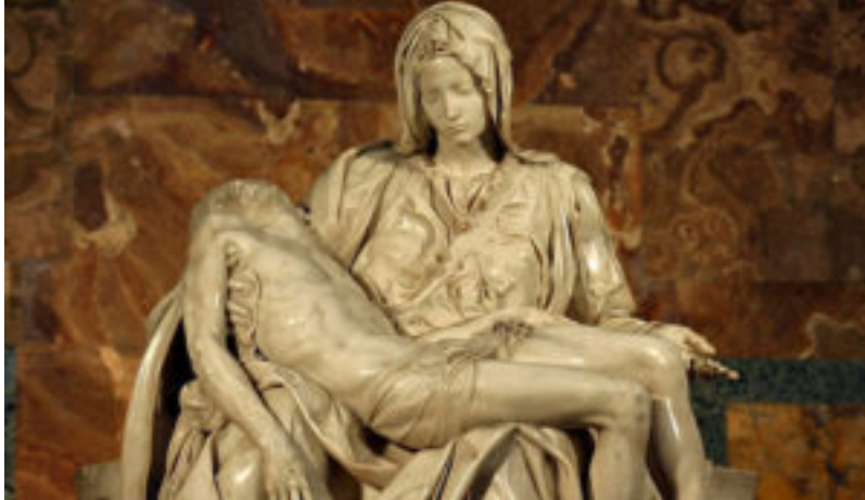
The Pietà - Finely-polished masterpiece by Michaelangelo

How we see Ascension depends on what our goal, aim, or desire is.