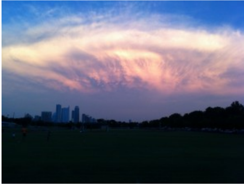
Lenticular cloud, probably masking a Mothership