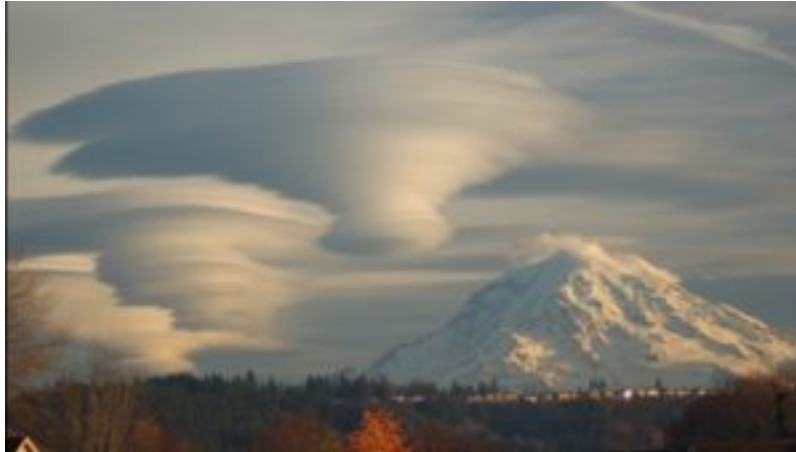
More lenticular clouds, cloaking spaceships