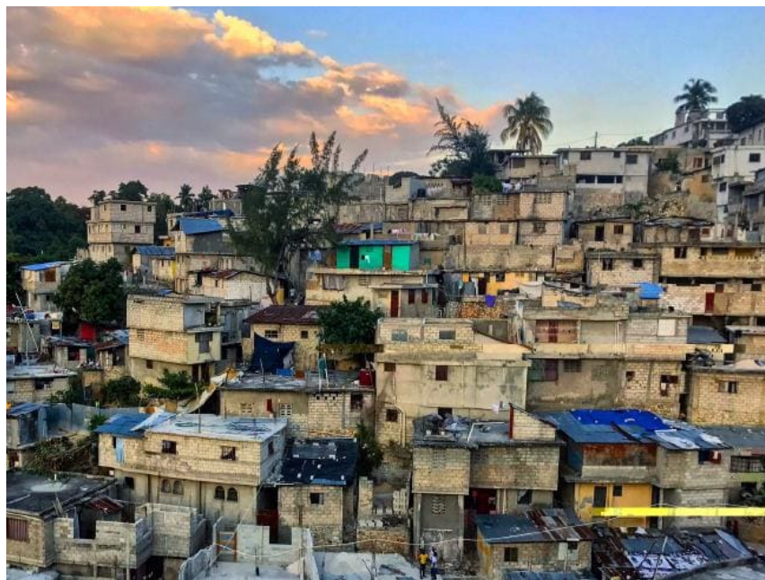
Haiti is facing a human trafficking crisis.

The children are told that we are planning an underage sex party for a group of wealthy Americans and Australians.