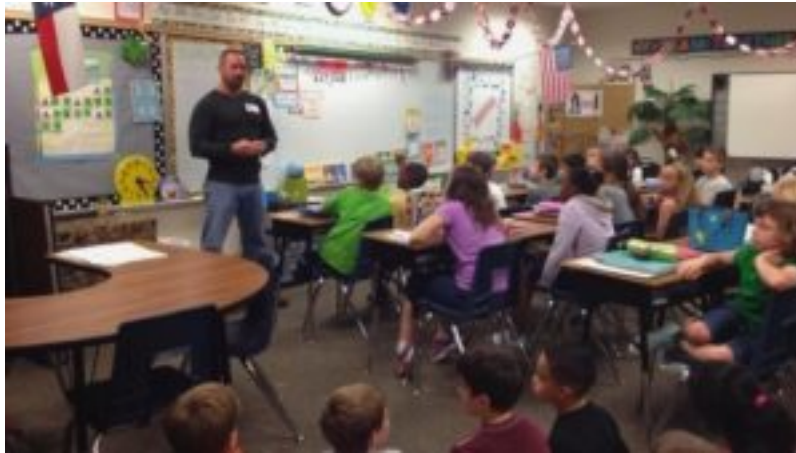
Navy Seal talking to school children

We in society seem to have a tacit agreement. If something is amiss and it doesn't affect me, providing you don't make me declare my knowledge of it, I'll turn a blind eye and get on with my life.