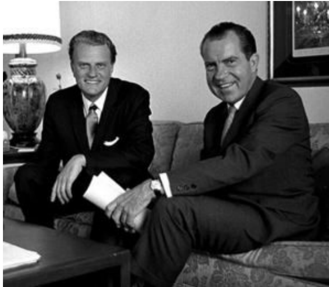
Evangelist Billy Graham and Richard Nixon.