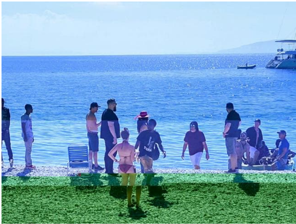
The traffickers prepare to board the yacht.