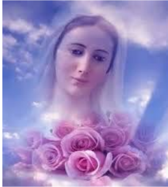
The Divine Mother apparently incarnated as Mary

The Divine Mother issues her announcement, reposted from Sept. 6, 2017.