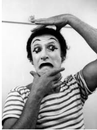
Marcel Marceau: The Mask that Stuck

Given that Archangel Michael has agreed to discuss the constructed self or persona with us on An Hour with an Angel , May 13, 2013, perhaps I can be permitted a few words on it, to allow us a context to listen from.