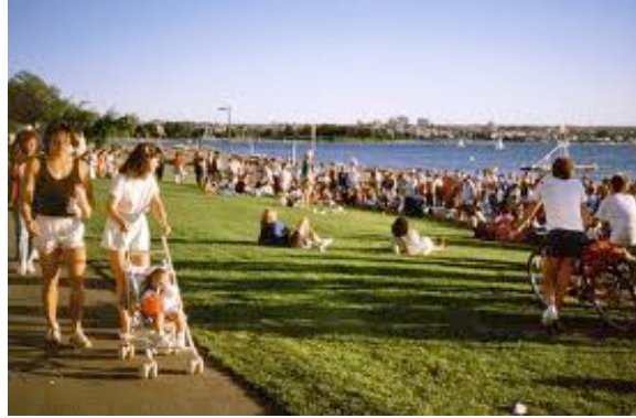
English Bay, Vancouver, on a summer day

I had a brief experience yesterday which has quite affected me. You recall that Archangel Michael said that we, as lightworkers, can visit the higher states but we'd be best advised not to stay in them or we'll forget our lightwork. (1)