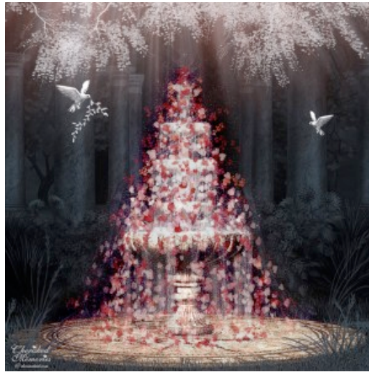
Fountain of Love by Cherished Memories

The other night I awoke at around 2:30 a.m. absolutely certain that I was a fountain of love. As are we all.