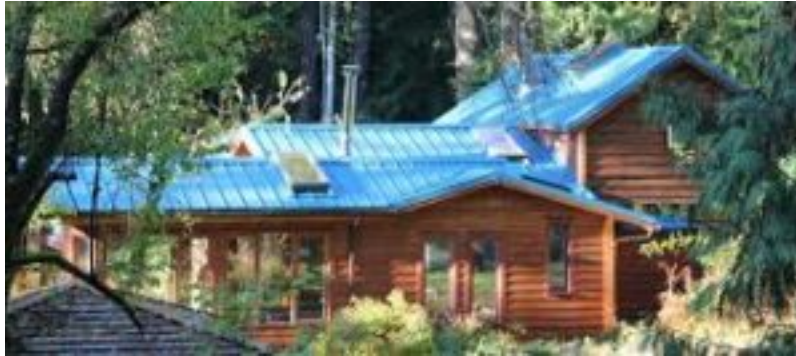
The Lodge at Xenia Retreat Centre

http://goldenageofgaia.com/2018/09/21/original-innocence-2/