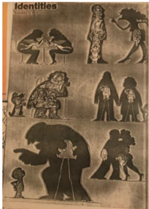
A depiction of Top Dog/Underdog

http://goldenageofgaia.com/2018/12/02/revisiting-self-control-self-mastery/