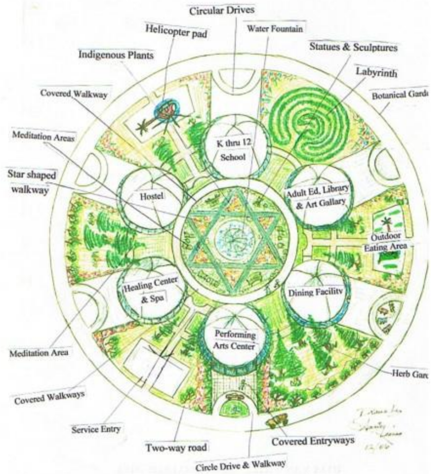
Suzy Star's Creative Communities